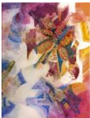
Image and Word: A Different Art Exhibition

When: For the Month of November During Luna Coffee Business Hours